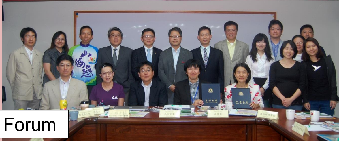
Cycling Tourism Collaboration Forum