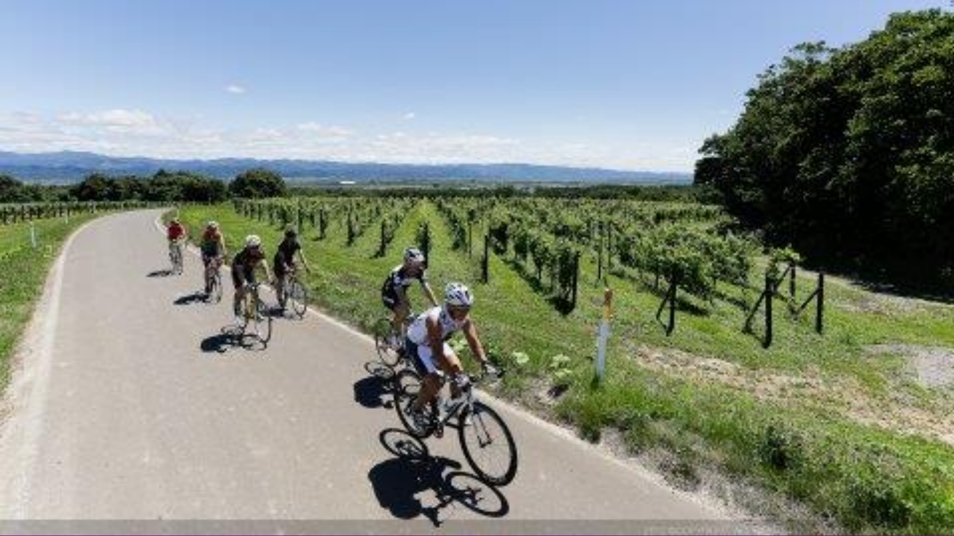
Bibai city, Hokkaido Japan