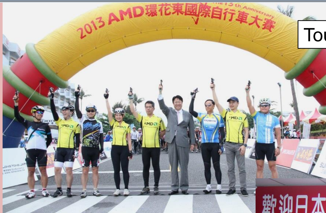
Tour of East Taiwan