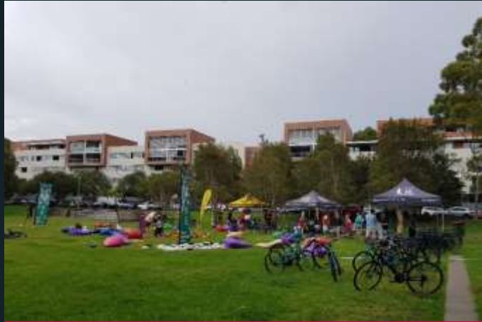
Try-a-bike: Joynton Park