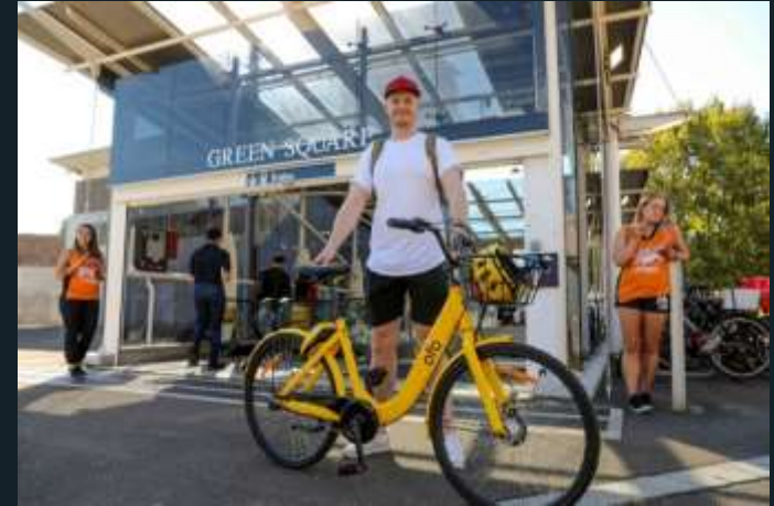
Personalised route advice