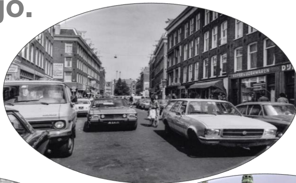
Eerste van der Helststraat, Amsterdam 1978-2005