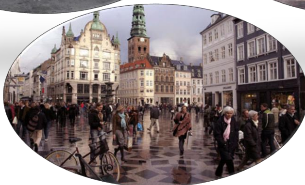
Stroget, Copenhagen 1964-2014